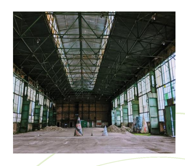
Hala Minda Project

The S+T+ARTS Centre is established through 'creative reuse' of the Old Municipal Slaughterhouse in Viana do Castelo. This approach brings together history, heritage and urban renewal, promoting urban requalification and social inclusion in the area.