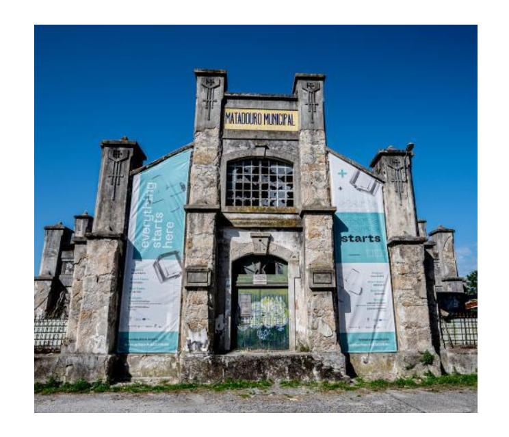
Viana S+T+ARTS Centre

The project tests a transitional model of urban regeneration to improve mental health in young people. Neglected 70s urban complex will be regenerated testing co-creation activities with youth to enhance affective bonds to the place.